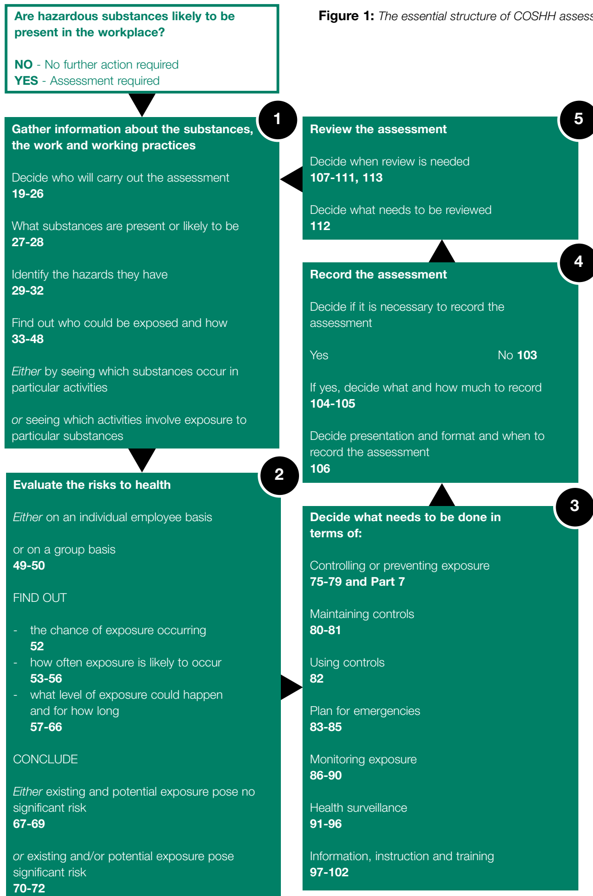
Figure 1: The essential structure of COSHH assessment

Note Bold figures refer to paragraph numbers